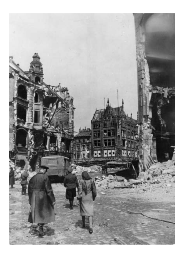
FIGURE 6 Friedrichsgracht Street in the Spittelmarkt quarter of Berlin, May 1945.

mutual bitterness among all the camps is very great. From every side I hear people complaining about each other, some seem justified, and others don't even have the appearance of justification. We have not formed a united front at all!" 172