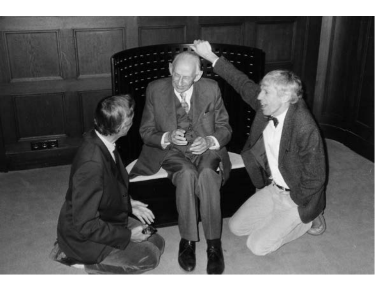
FIGURE 14 Gershom Scholem with Ivan Illich ( left) Hartmut von Hentig ( right) at the inauguration of the Wissenschaftskolleg zu Berlin, November 1981.

the Halensee is sympathetic. There are a total of eighteen fellows, including some very smart people, and good connections are being made with most of them (nine foreigners!)."<sup>76</sup> The fact that Scholem did not count himself among the foreign fellows shows that his attachment to Berlin seemed natural and self-evident to him.