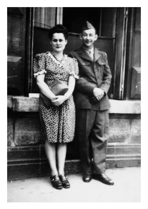
FIGURE 3 Scholem in a US Army uniform with an unknown woman, Paris 1946.

cent, that the JDC, for reasons of its propaganda in America, would be very favorably disposed to transferring the books to America so they could say: Look what we did for the Jews of America!<sup>45</sup>