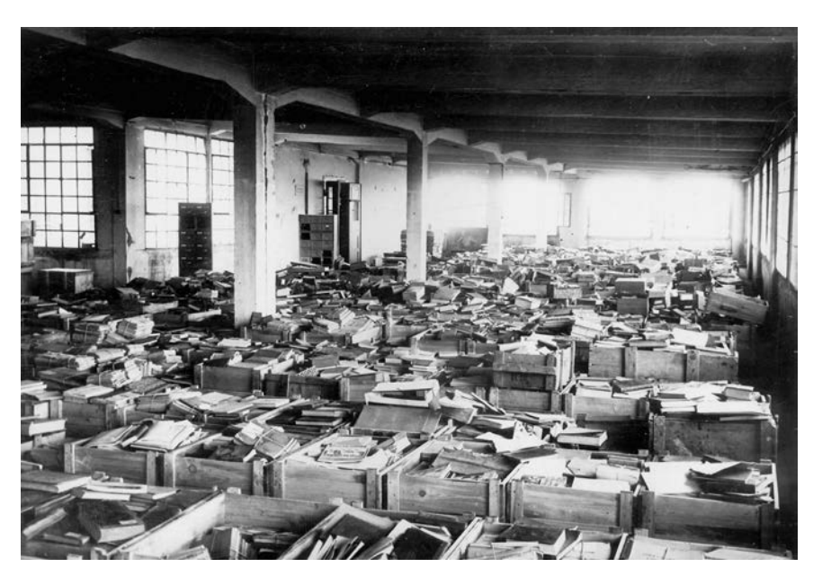
FIGURE 4 Books at the Offenbach Archival Depot. 1946.